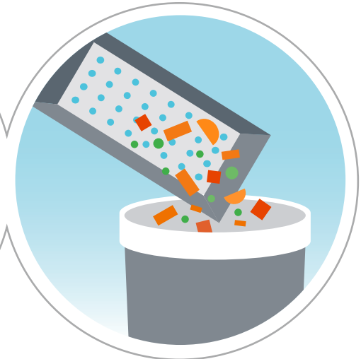
External scrap basket allows easy waste removal between washes.